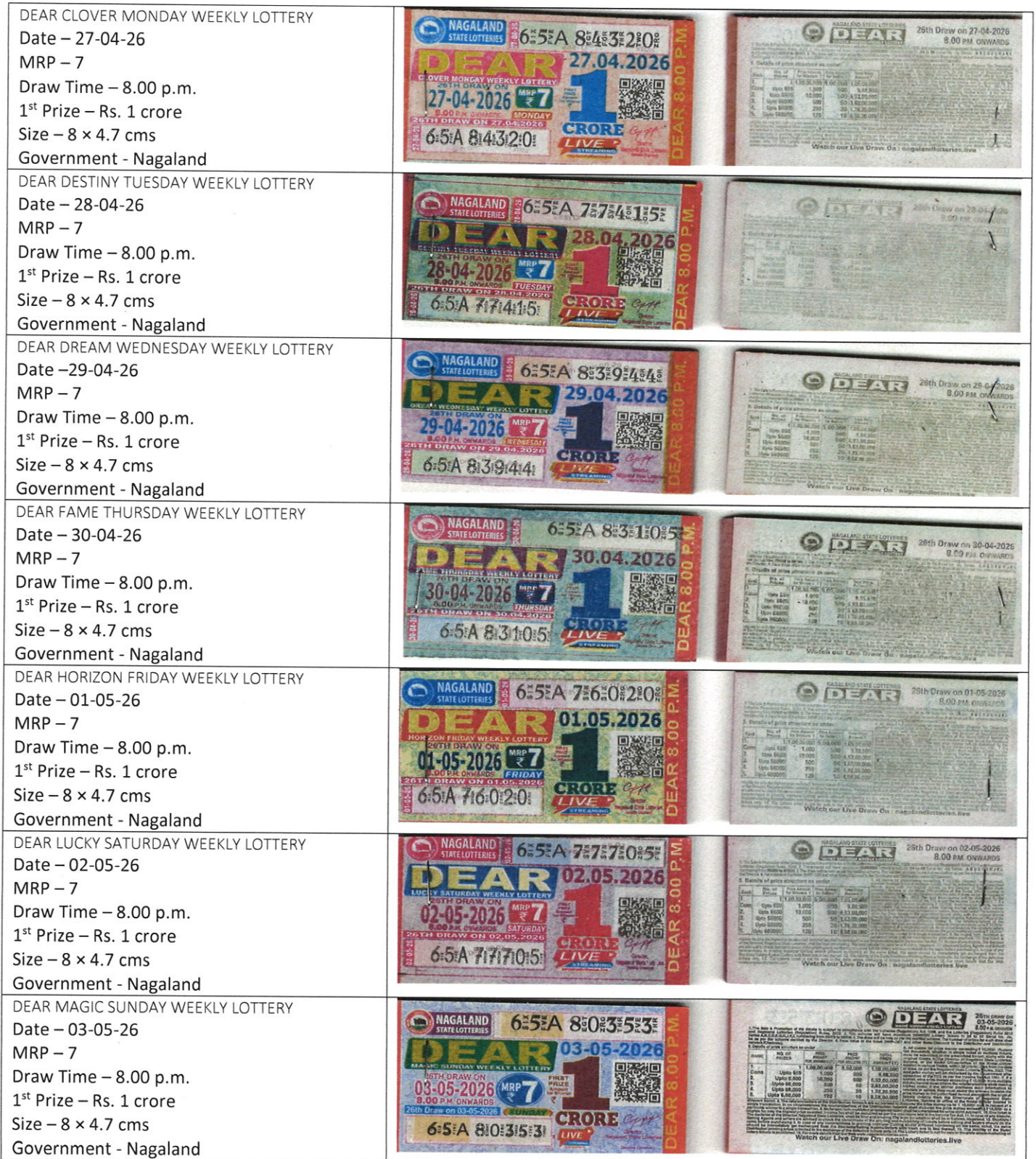
Photo Copies of tickets organized by Government of Nagaland draws of which will be held in between 27.04.2026 to 03.05.2026 at 8.00 p.m. onwards

For West Bengal Lottery Stockist Syndicate Pvt. Ltd.