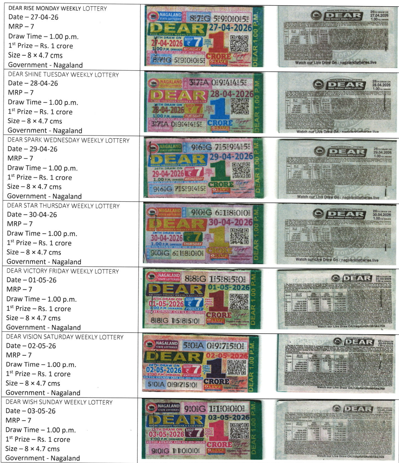
Photo Copies of tickets organized by Government of Nagaland draws of which will be held in between 27.04.2026 to 03.05.2026 at 1.00 p.m. onwards

For West Bengal Lottery Stockist Syndicate Pvt. Ltd.